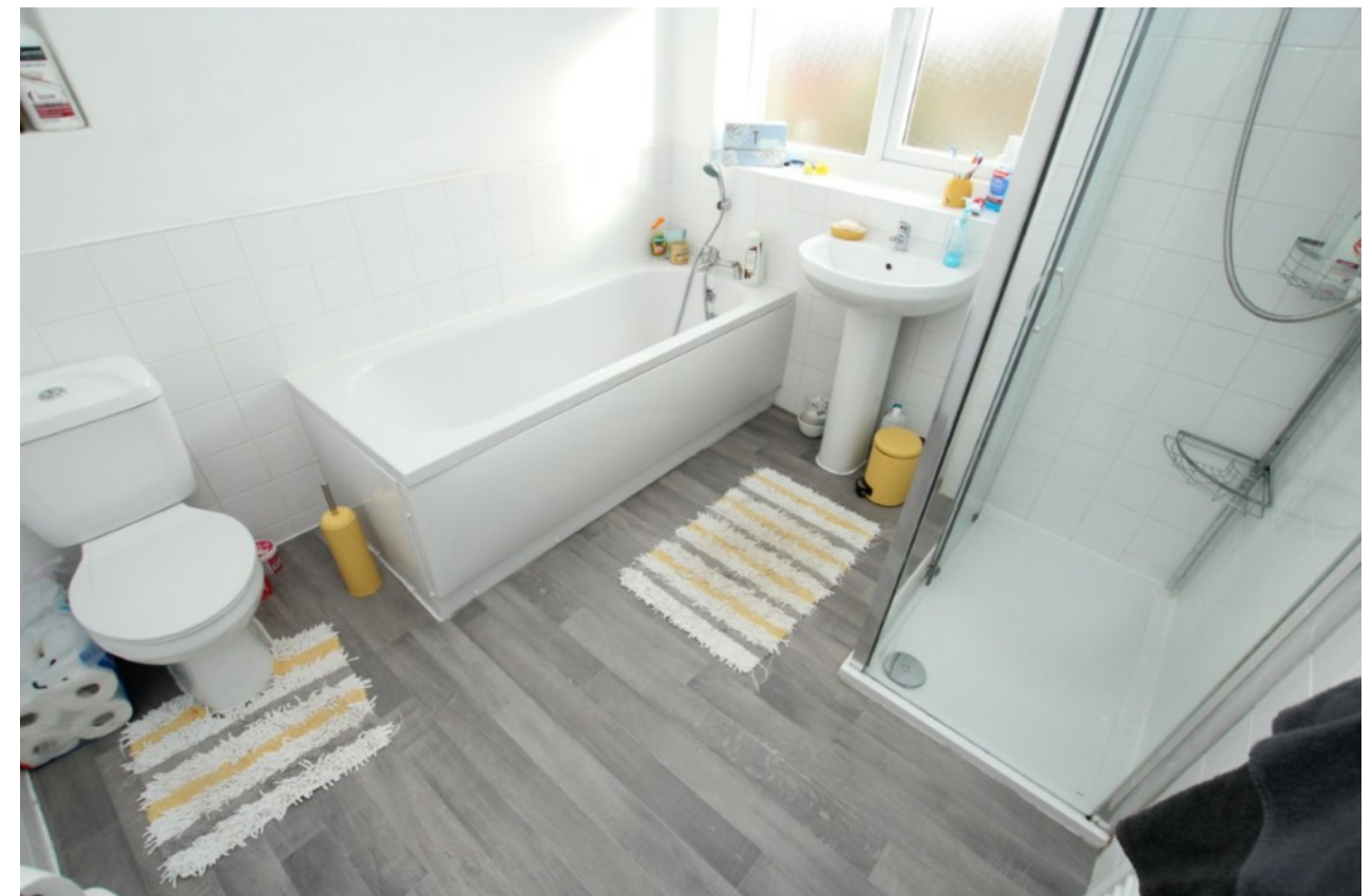
Broomfield Crescent, Middleton M24 4EP