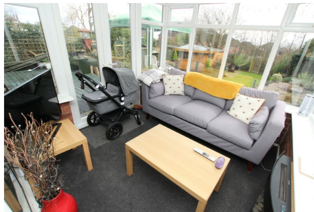
Broomfield Crescent, Middleton M24 4EP